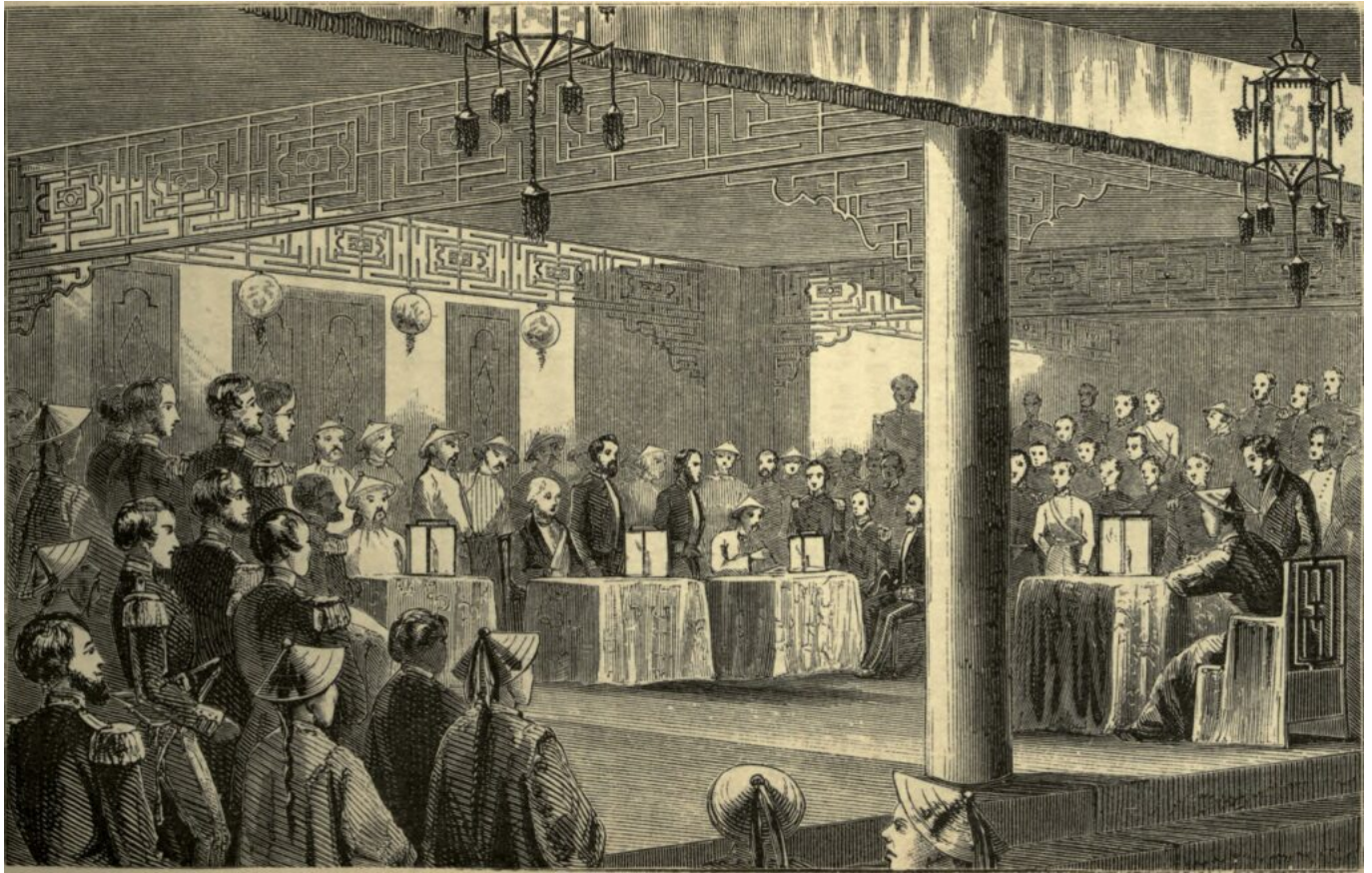
The Treaty of Tianjin

The Anglo-French soldiers continued to demolish the Chinese soldiers and soon enter Tianjin in 1858, which gave the emperor a signal that his own life was at risk and forced the Chinese into negotiation. The Treaty of Tianjin was signed in June 1858, which fully legalized the trade of opium and opened even more ports for trading. The British and the European countries continued to exploit the Chinese and feed them opium until the 1950s. As a result of the one-sided wins that the technologically superior British force achieved, the Chinese government recognized the necessity to modernize its military.