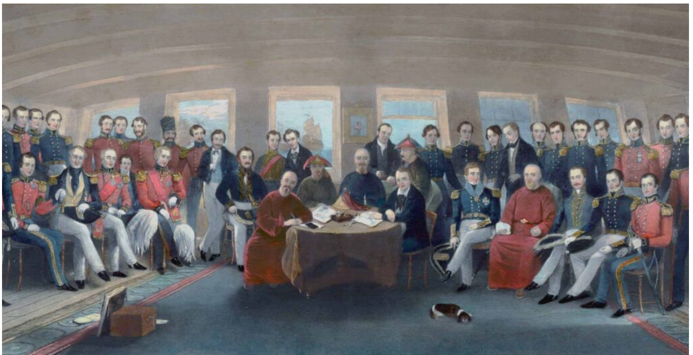
The treaty of Nanking was signed

Most of the Britishers fled China only to return with the Royal Navy in June 1840, with a large number of warships. The British captured Zhoushan Island with little to no opposition faced. Though the Chinese didn't surrender and fought back, the lack of advancements in weaponry like guns and warships caused them the war. The British soldiers completely overpowered and destroyed the Chinese, and their sand made war forts with soldiers fighting with bows, arrows, and swords. With the British seizing many more islands and towns, they finally arrived at Zhejiang, where the final battle took place, killing many of the Chinese who were defending it.